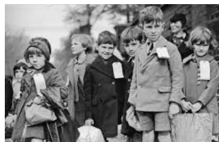
Secrets and Spies Day at Coleshill (Approximate cost £8)